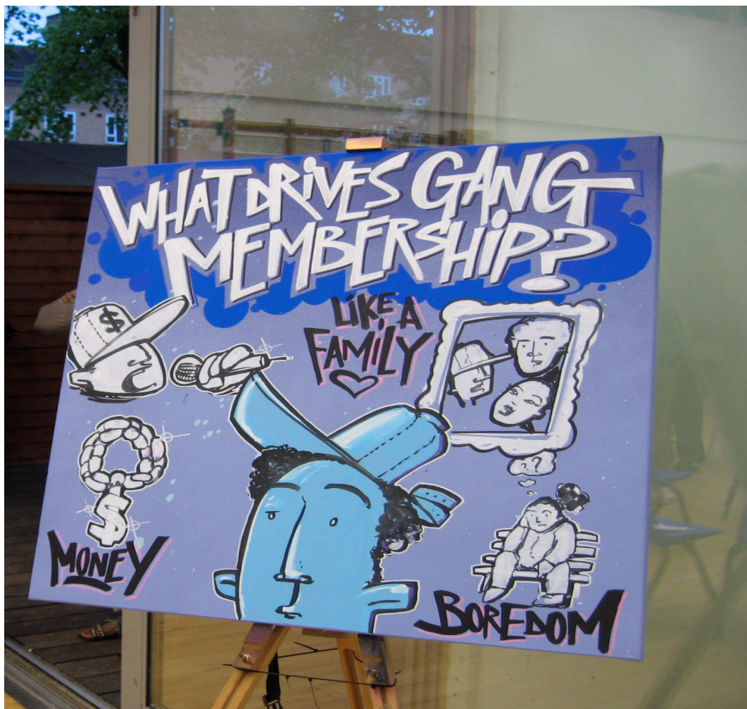
Artists courtesy of www.paintshopstudio.com